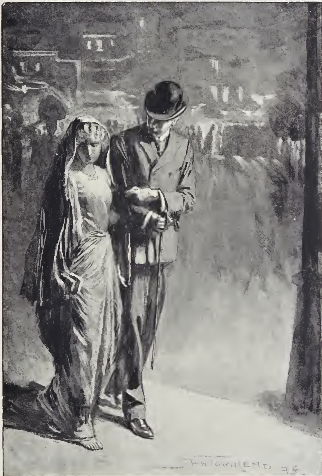
"SAY THAT YOU'LL MARRY ME"